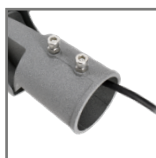
installation on ø60 poles