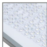
light source with increased efficiency