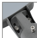
tilt angle adjustment