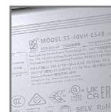
SOSEN 1-10V isolated power supply