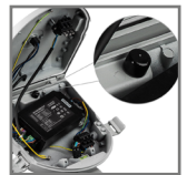
luminaire equipped with a pressure equalisation filter