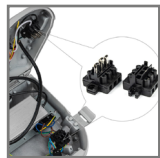
safety scissor-type voltage disconnect