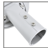
installation on Ø48-Ø60 poles