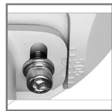
tilt angle adjustment