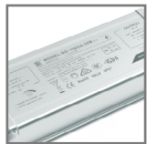
isolated power supply SOSEN