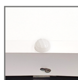
versions with passive infrared sensor (PIR)