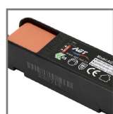
AGT power supply included