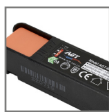
AGT power supply included