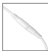
quick-connect power supply for easy installation